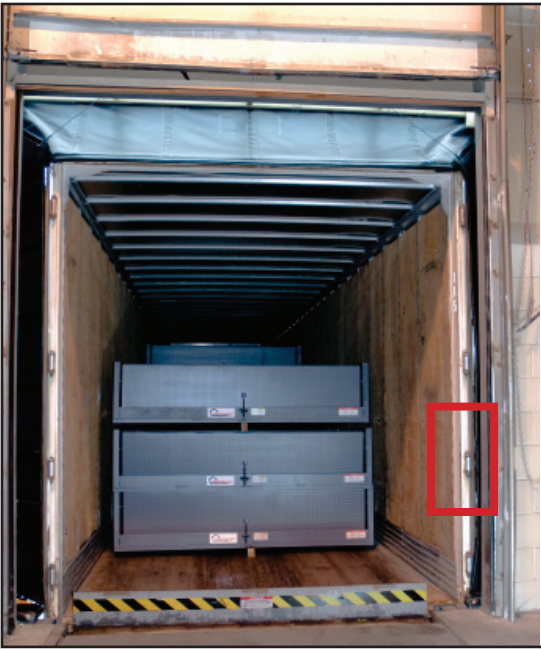
Full Access to Trailer Door Opening