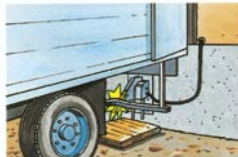
Competitors impact operation can cause damage