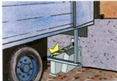
Competitor's higher designs result in impacts

The non-impact operation of the Pentalock LPR35 ensures continuing trouble free performance and eliminates damage to the restraint system or to an incoming vehicle's rear impact guard. Other non-impact models are available, but only the Pentalock Model LPR35 vehicle restraint provides a structural protective guard as standard equipment. The structural guard withstands accidental impact to the operating components caused by unusually low incoming vehicles and snowplows. The compact design reduces the projection from the dock face as well as the lowered height of the restraint, thereby minimizing the risk of accidental impact from incoming vehicles, exterior cross traffic or snow removal equipment.